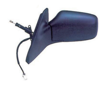
S40 V40 '96-'04 TH-4604 (VM-460H) CABLE TYPE,W/ HEATED