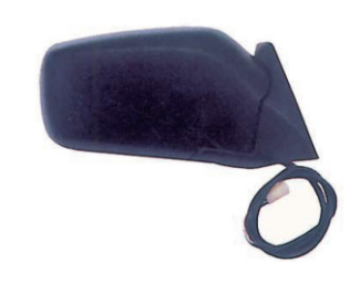
240 '85-'91 TH-2400 (VM-240) ELECTRIC TYPE, (4-PINS, ROUND CONNECTOR)